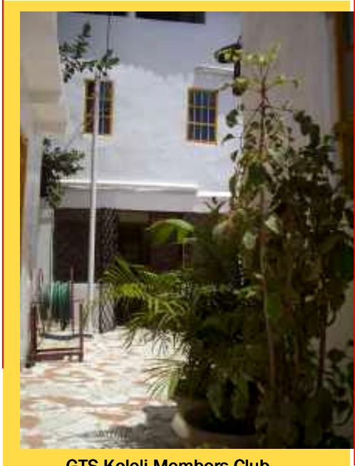
GTS Kololi Members Club