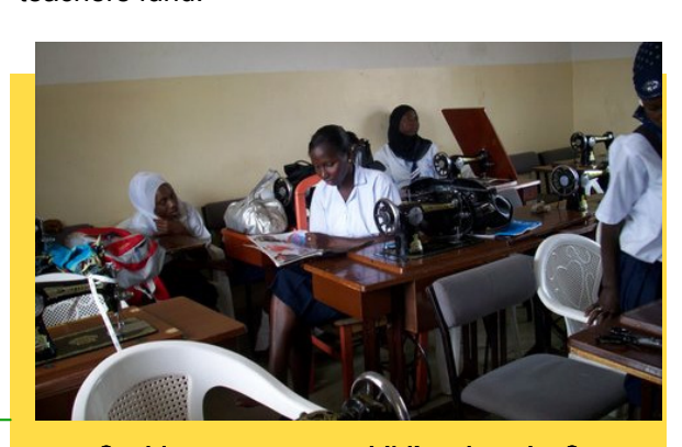
Could you sponsor a child's education?

Perhaps you feel able to make a broader contribution to education in the Gambia? Our teachers need training as they generally do not have any formal teaching qualifications. To improve overall teaching practice we need funds to send them to Gambia College to gain these valuable qualifications. We will also need funds to increase their salaries once they are better qualified, so we are looking for a minimum donation of £10 a month for our teachers fund!