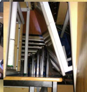
The very full shed!