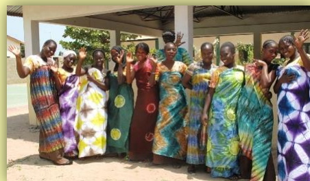
Beautiful fabrics made by skills students