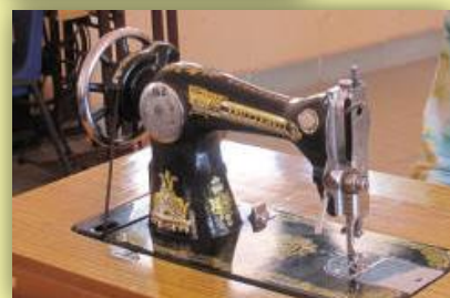
Sewing machines and sowing seeds!

The commitment of Gambia Education and Teaching Support in providing quality education to the needy Gambian children is a clear testimony. During the year under review a lot of infrastructural developments were undertaken by GETS, the expansion of the sewing class because of the high demand the previous room cannot cater for our needs. New sewing machines were bought, the garden walls built and a sports area also built.