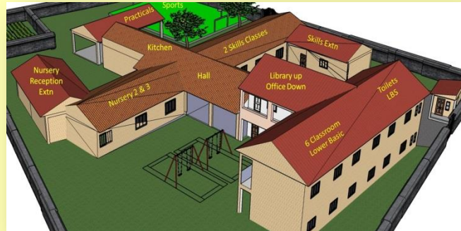
Artist's impression of the changes at Sunrise

More updates as work progresses but this extra cash is a great reward for everyone's hard work to make Sunrise a success story and help the youngsters and the community in Bakoteh.