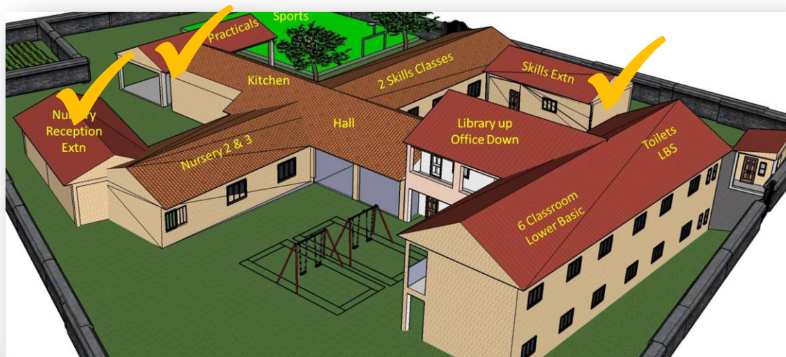
Artist's impression of the Sunrise Centre – showing 2015/16 project completion

Our next project will be to build a new staff toilet block at the back of the kitchen. This is a requirement of Gambian Education authorities. We are looking for more cash to complete this important work.