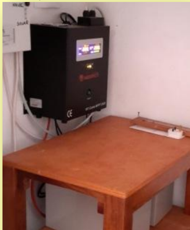
New solar system

We're mending things again, that are broken either by children, by wear or by the elements. The list is long but we have had to spend money:-