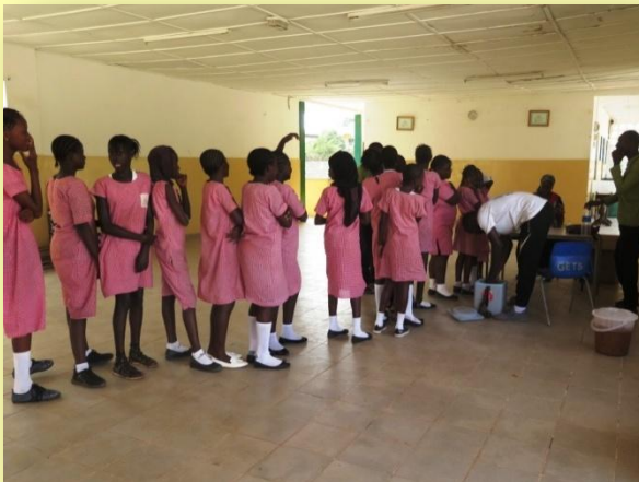
Nervous girls are waiting in line for their "Jabs"