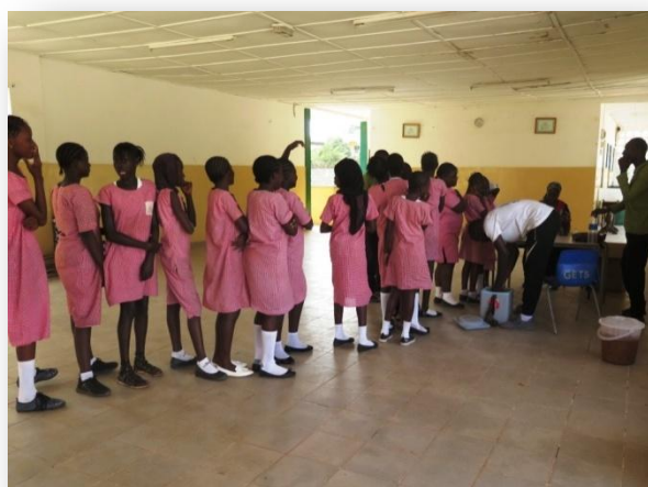
Nervous girls are waiting in line for their "Jabs"